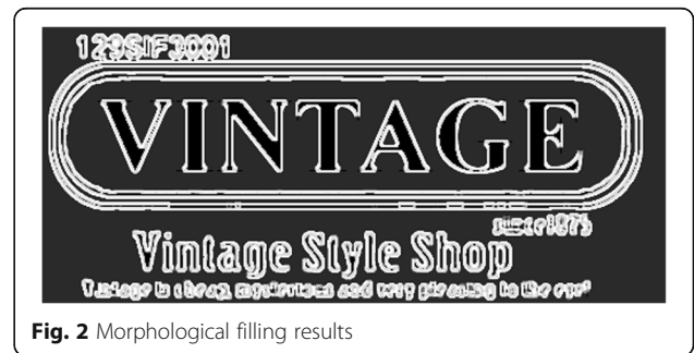
Fig. 2 Morphological filling results

The 0-pixel set or the 1-pixel set that communicates with each other in a binary image is referred to as a connected component. There may be multiple connected components in one image after segmentation, and each connected component corresponds to a target image region, and the process of assigning corresponding labels to each target image region is called a mark. Common connectivity area marking algorithms mainly have four connections and eight connections. The eight-connected region means that from each pixel in the region, it can reach any pixel in the region through eight directions under the premise of not getting out of the region, namely, eight directions of up, down, left, right, upper left, upper right, lower left, and lower right. However, the four connected areas are only connected in the four directions of up, down, left, and right. In this paper, the candidate text area is marked by the eight-neighbor labeling algorithm. The background is marked as 0, the