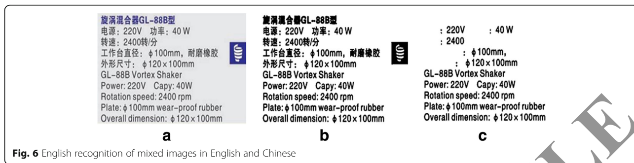
Fig. 6 English recognition of mixed images in English and Chinese

the same time, not only the text portion of the image is recognized, but also other image portions are also emitted, so it has a certain influence on the English recognition. In the face of a complex background, large illumination impact or serious graphic deformation, the detection method proposed in this paper cannot accurately detect the text area and eliminate the influence of other factors in the background. Therefore, the proposed algorithm has a better translation and recognition effect on English text in a fuzzy environment.