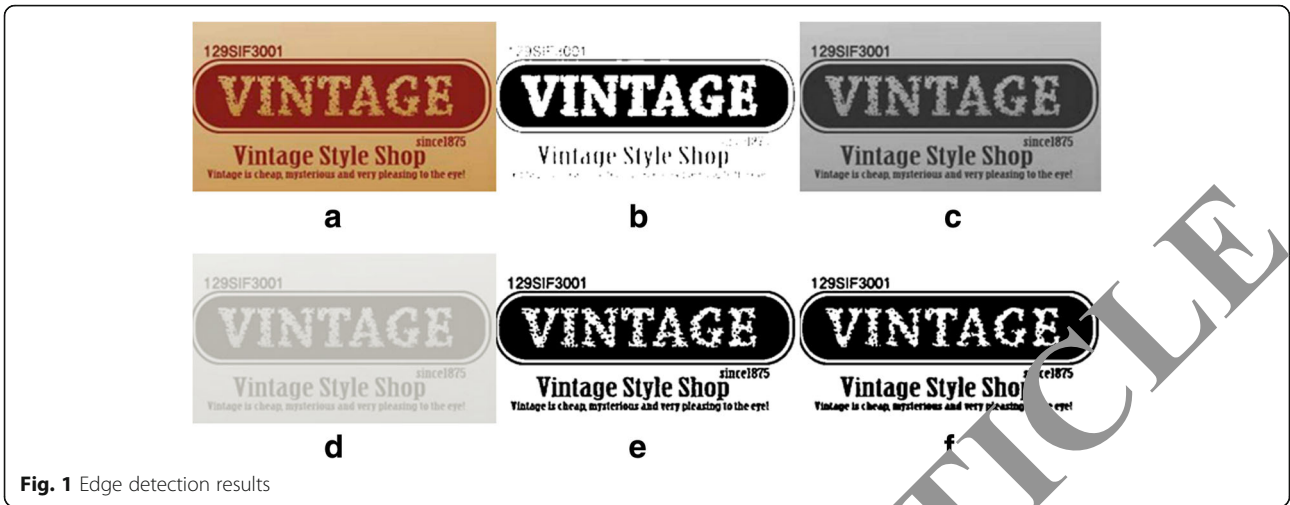
Fig. 1 Edge detection results

elements can be filled. Corrosion operations can remove targets smaller than structural elements (such as burrs, small bulges), so that different sizes of objects can be removed from the original image by selecting structural elements of different sizes. At the same time, corrosion can also eliminate object boundary points. If there is a small connection between the two targets, then if the structural elements are chosen to be large enough, the two targets can be separated by a corrosion operation.