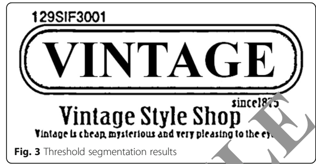
Fig. 3 Threshold segmentation results

Among them, g1 = [-1, 0, 1] , g2 = [-1, 0, 1] , * means T , and \cdot represents two-dimensional linear convolution. The difference between the x -direction and the y -direction is obtained separately, and then the absolute value is stored in s . According to the threshold \gamma , the binarized image e is obtained as shown in Fig. 3: