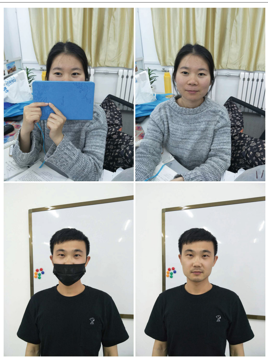
Fig. 2 Image samples in the manually collected database

As shown in Table 2, the proposed approach outperforms the state-of-the-art face verification methods, while the number of images used in the training set to train our model is less than most of the other techniques like FaceNet, which exploits 200 millions of images in its training process.